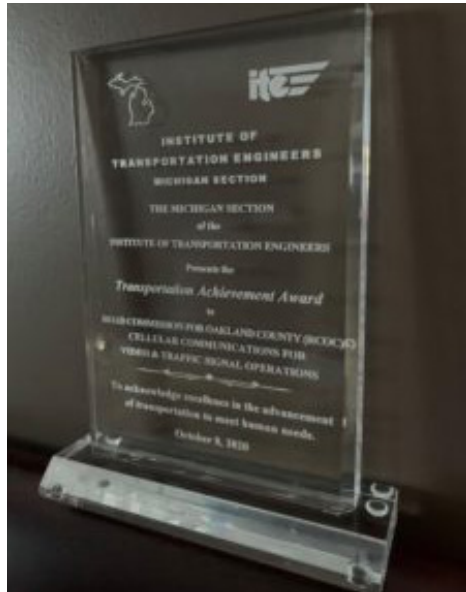
RCOC Transportation Achievement Award