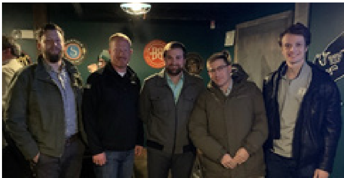
Lansing Winners - Not Last